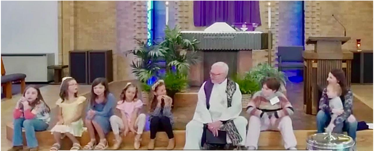
Palm Sunday Children's Message

Maundy Thursday Service 7:00 pm, April 2 Calvary, Moline